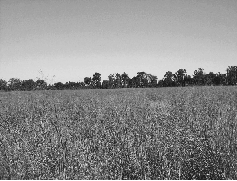
Fig. 11.3. Switchgrass ( Panicum virgatum ) field planted for biomass production near West Point, Mississippi, USA.

Fig. 11.3). But many of these studies were conducted on Conservation Reserve Program fields, which limit applicability to biofuel production at airports. Recent studies examining impacts of cellulosic biofuel crops on wildlife indicate that both Miscanthus and native grasses, including switchgrass and native warm-season grasses (as mentioned earlier), may provide benefits to some birds during winter and breeding seasons (Murray et al. 2003, Bellamy et al. 2009, Sage et al. 2010). The benefits of Miscanthus are temporary, however, without continuous wildlife management practices necessary to maintain the features of established plots that are attractive to birds (Bellamy et al. 2009). These features may be lost if plots are managed primarily to maximize biofuel production (Bellamy et al. 2009). There are additional questions regarding wildlife response to large plots of Miscanthus in the USA, as the vegetation structure is different from native grasslands, and it is unknown if avian species would perceive the bamboo-like vegetation as suitable habitat (Fargione et al. 2009).